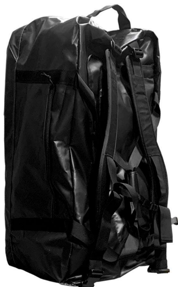
120 L DUFFEL BAG + REMOVABLE BACKPACK STRAPS