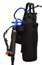
TAC SPRAYER W/ MOLLE BAG