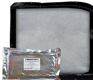
4' X 4' SHUFFLE PIT 24" X 24" FIBERTECT PADS