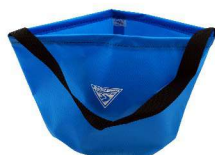
COLLAPSIBLE MEDIA BUCKET