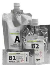
22 OZ DAHLGREN DECON